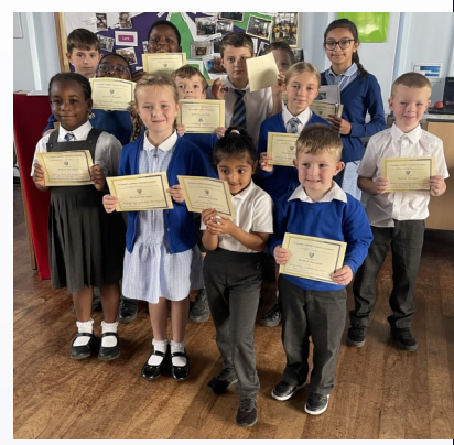
Congratulations to the children of the week; Friday 24th September

This week the children have enjoyed two assemblies.. On Wednesday the children enjoyed learning about Parliament and today the children gained an understanding of how to clean and save water at home.